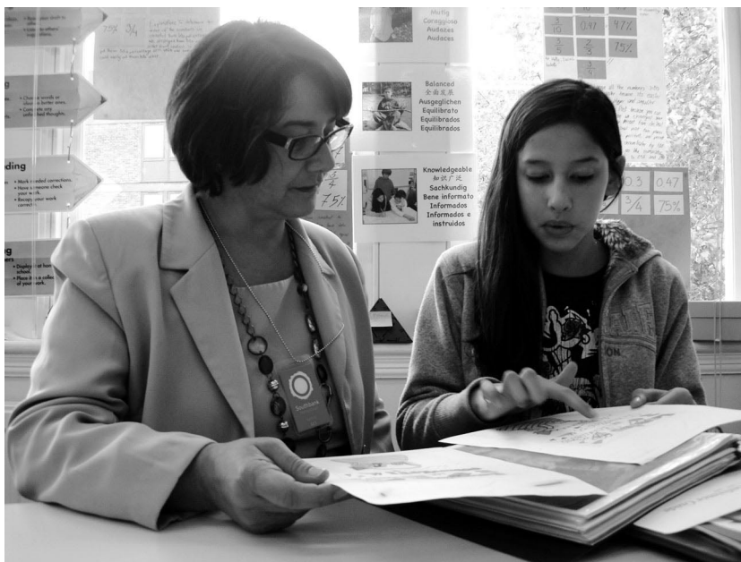
Student discusses exhibition portfolio with mentor

In the final year of the PYP the students participate in a culminating project, the PYP exhibition. This requires that each student demonstrates engagement with the five essential elements of the programme—knowledge, skills, concepts, attitudes, action. It is both a transdisciplinary inquiry conducted in the spirit of personal and shared responsibility, as well as a summative assessment activity that is a celebration and rite of passage, symbolic and actual, from the PYP into the middle years of schooling (example 16).